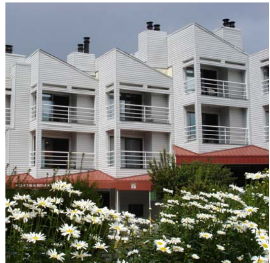
RID is indeed a great accomplishment.

Less than twenty percent of the 3,700 RCI-affiliated resorts achieve this high level. The Christie Lodge has always enjoyed a high exchange value, and this award helps maintain that awesome trading power that our owners treasure.